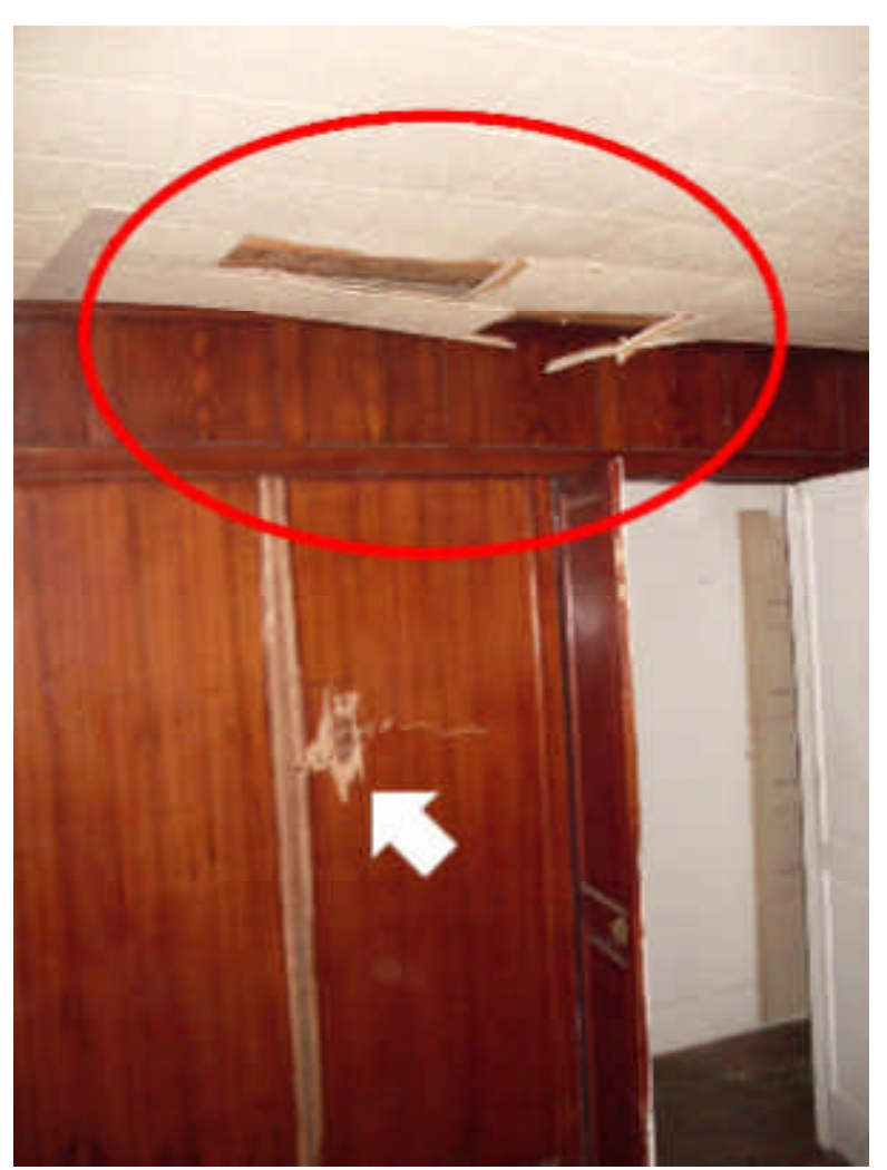
Needs Attention, there are areas of damage to the wall and ceiling.