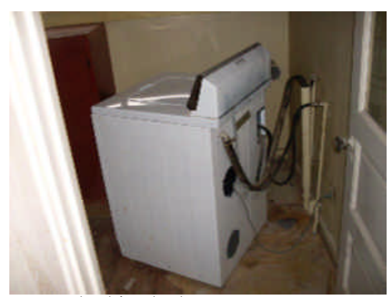
Hook ups are present but deferred maintenance.