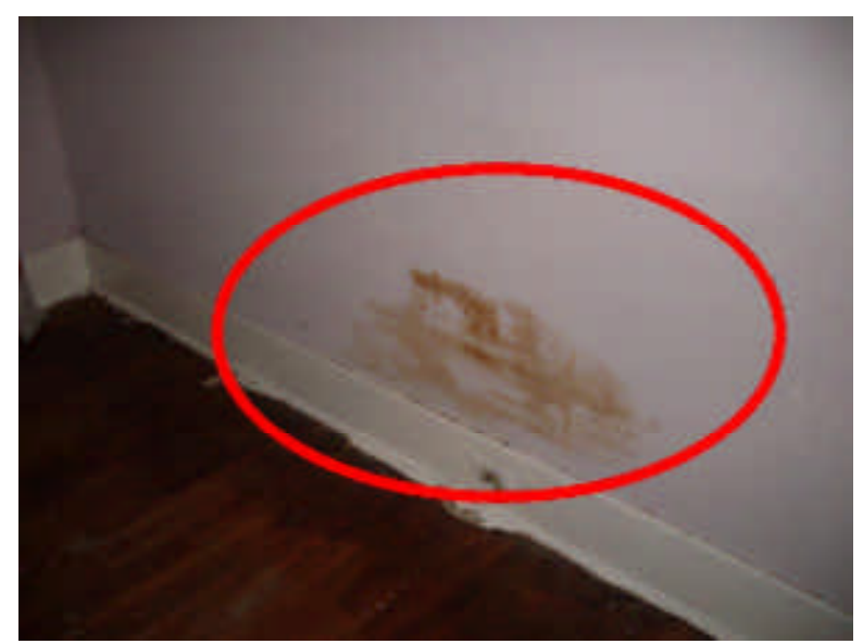
Needs Attention (front bedroom), there are areas of moisture stains, on the wall which is on the other side of the bath room sink.