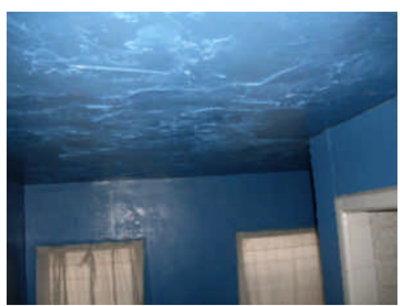
The blue painted ceiling appears to be in serviceable condition.