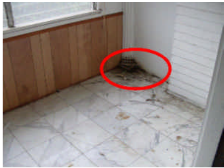
Needs Attention, there are areas of moisture stains, on the wall and bottom corner (the window with the awning is just outside of this area)