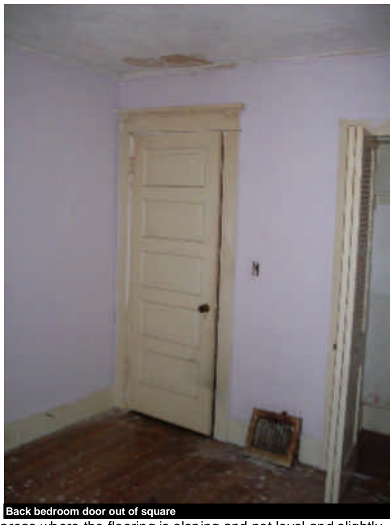
There are areas where the flooring is sloping and not level and slightly uneven indicating some settlement has occurred. The floors are not level and the windows and door frames may not be plumb. see the Foundation section of this report for more information.