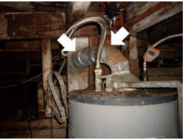
Needs Attention, the vent line from the water heater has a negative fall and the gases will not vent properly. This is a safety hazard and needs to be repaired.