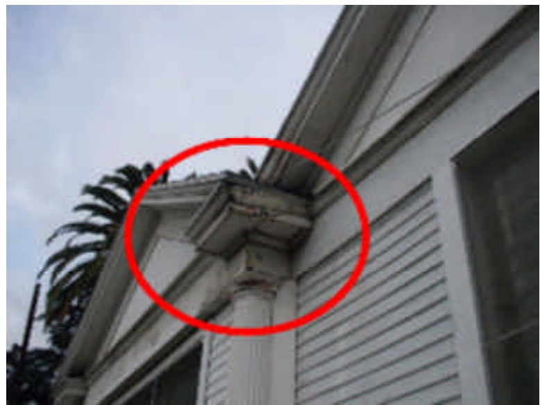
Not Acceptable , the trim has areas of damage such as on the right back side.