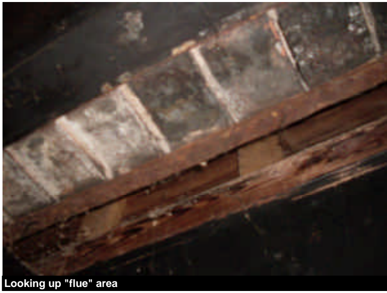
Not Acceptable: , the flue vent pipe has been removed and this can not be used and would require extensive work to modify and install a new gas appliance system.