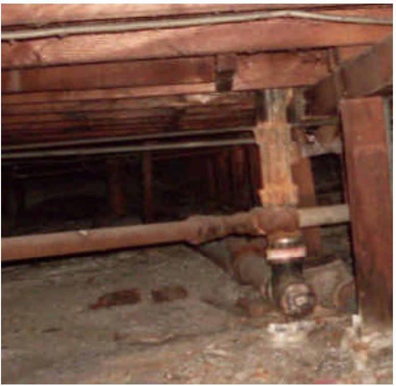
Needs Attention, there are rusty areas on the exterior of the waste lines. It is not possible to tell when but they will need replacing in the future as they continue to wear out.