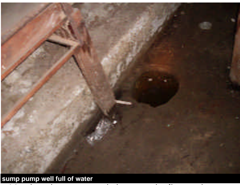
Not Acceptable , there is water percolating up at the floor and concrete wall and water is ponding on the floor.